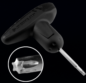
Dunlop Torque Wrench Sold Separately